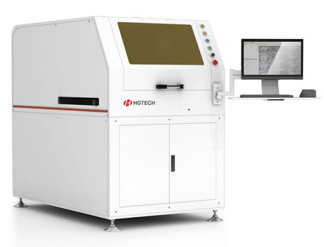
Cabinets and affiliated